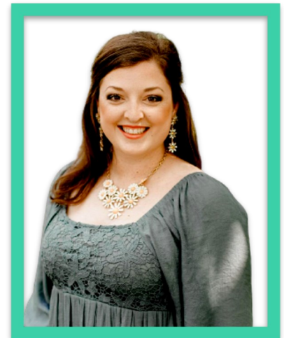
International Director of Marketing