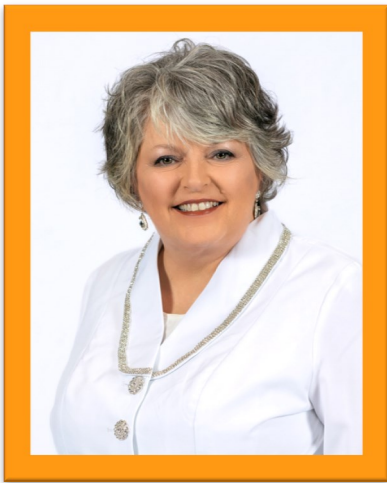
International Executive Director