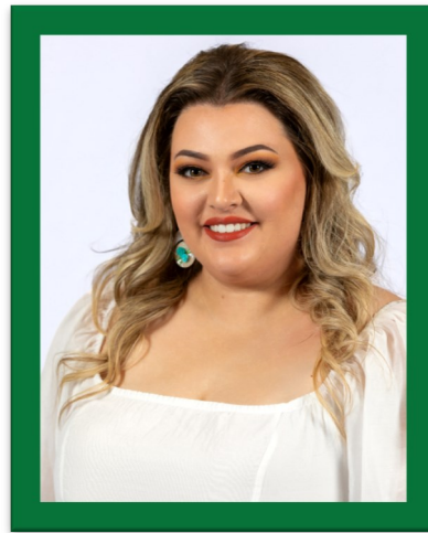
Assistant International Executive Director