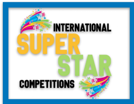
Super Star Optional Pre-Submits and Music