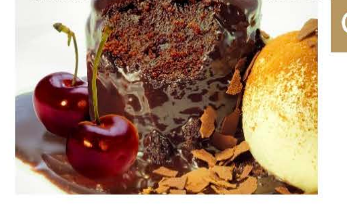
Brandy Snap Baskets (IBB) 6cm dia, 12 serves per inner

Wickedly rich dark chocolate gluten-free pudding covered in smooth dark chocolate sauce.