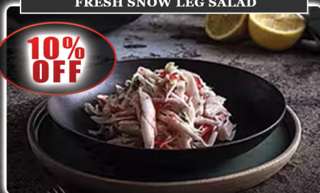
FRESH COCKTAIL SNOW CRAB CLAWS