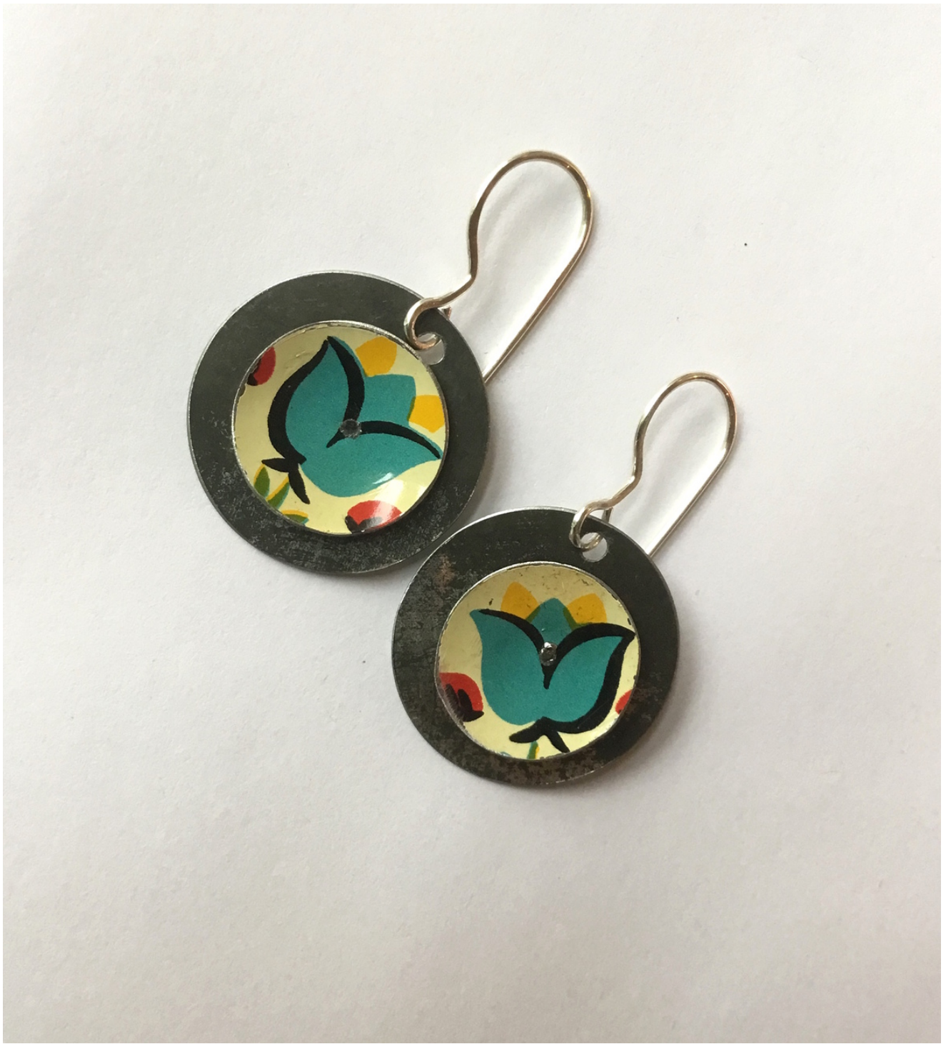
Betsy Sio layers circles on top of circles in these fun and colorful earrings made from upcycled tins.