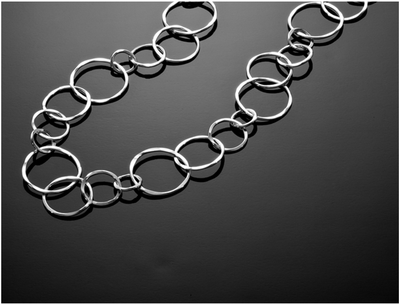
Celeste Friend's classic sterling silver chain features round rings in various sizes and textures.