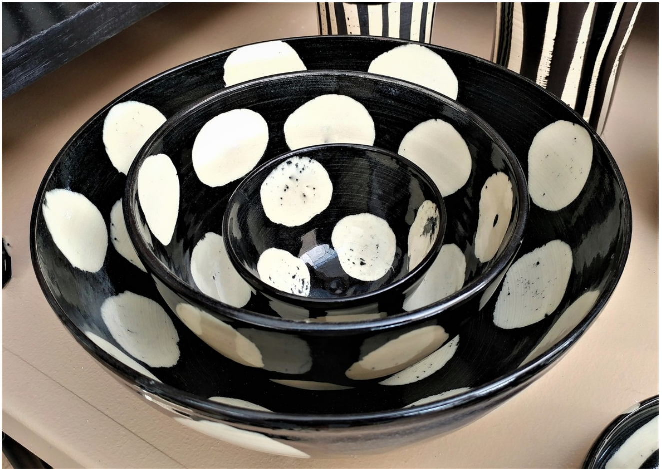
Big white dots on round black nesting bowls by Leslie Green Guilbault.