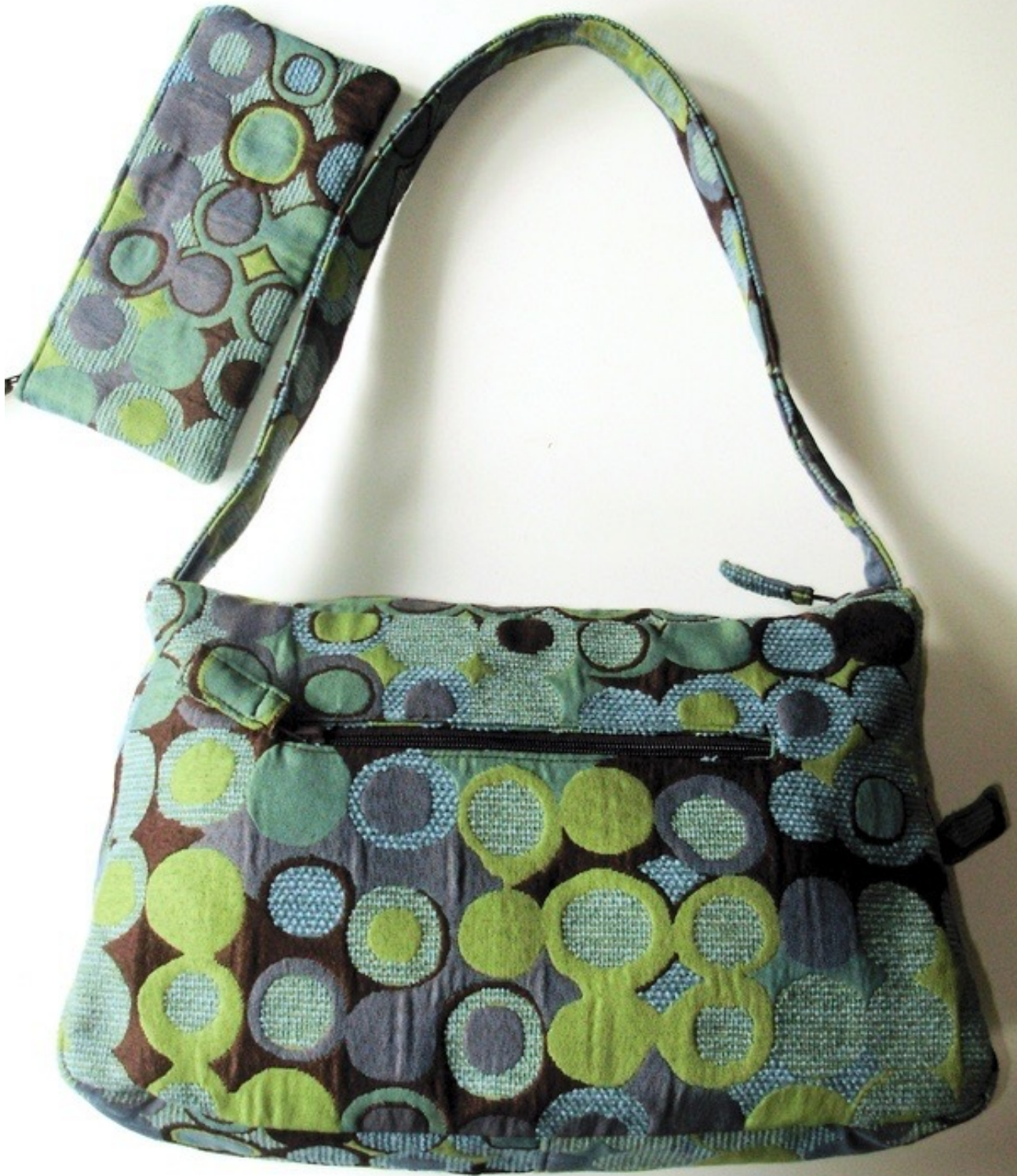
Wendy Edwards has always been particularly drawn to circles. She likes the wholeness that they represent. Here is just a small sample of the circle fabrics that she works in.