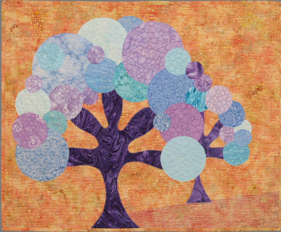
Sue Ellen Romanowski has given these trees lovely stylized round branches and leaves.