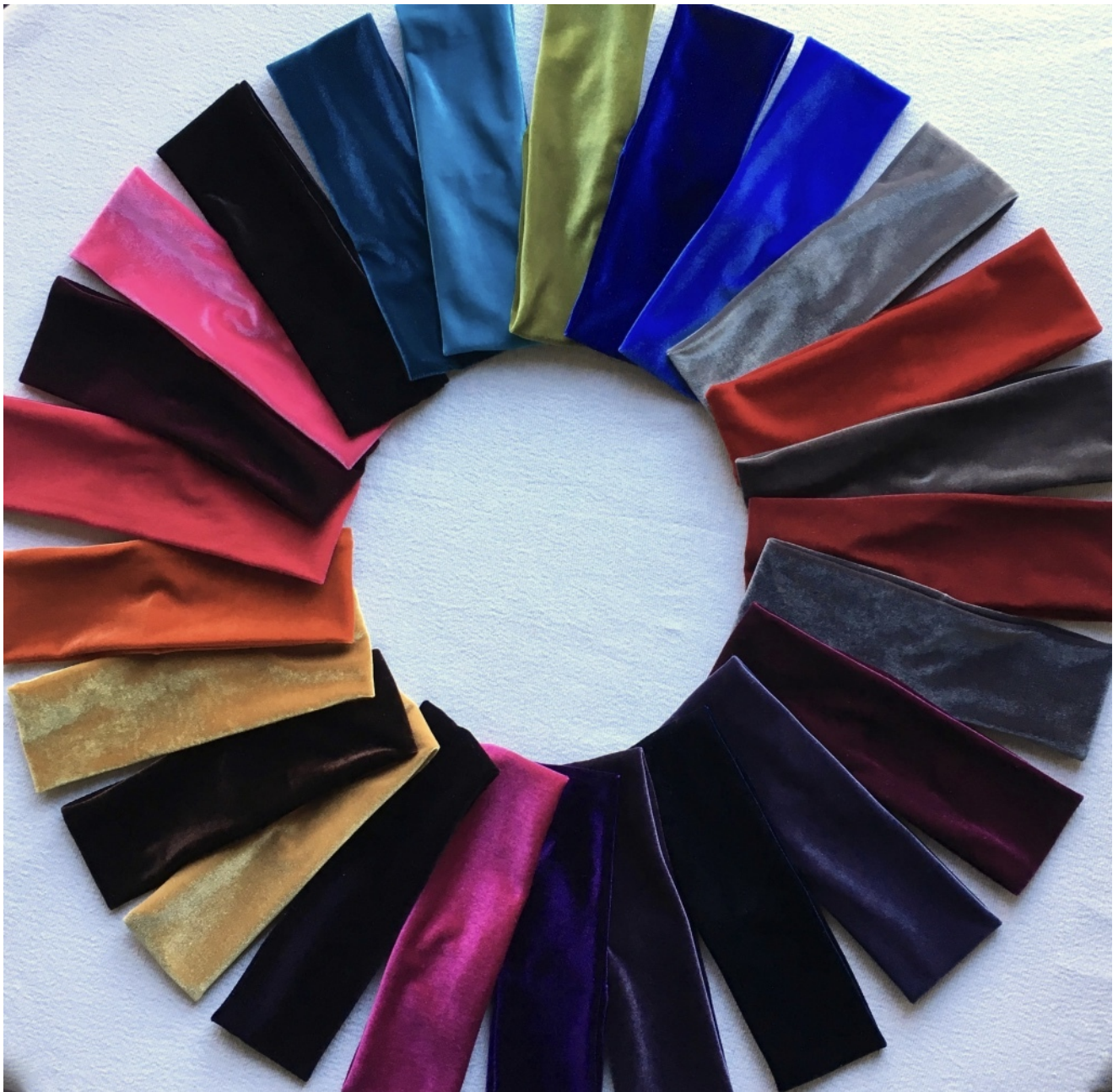
Heads are round (more or less), so headbands are round, and here they are arranged in a beautiful mandala of 26 colors!