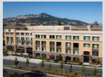
Millworks Marin County, CA 124 Units, Built 2009 $67,000,000