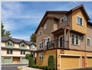
Northshore Kenmore, WA 86 Units, Built 2009 $22,100,000