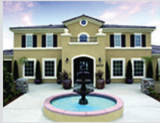
Avanti Sacramento, CA 216 Units, Built 2006 $29,750,000