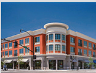
Theater Square Petaluma, CA 99 Units, Built 2005 $32,500,000