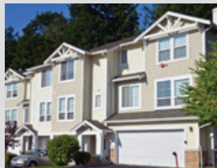
Langara Issaquah (Seattle), WA 134 Units, Built 2001 $28,200,000