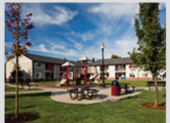
Reflections at the Park Vancouver, WA 244 Units, Built 2008 $21,000,000