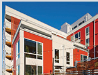
Greenhouse Seattle, WA 124 Units, Built 2012 $32,100,000