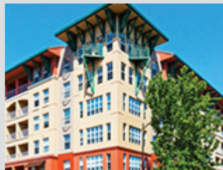
Rafael Town Center San Rafael (Marin), CA 113 Units, Built 2002 $50,000,000