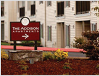
Addison Vancouver, WA 147 Units, Built 2008 $12,465,000