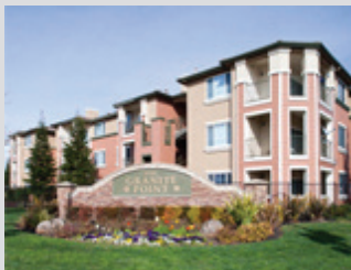
Granite Point Sacramento, CA 384 Units, Built 2003 $45,500,000