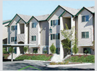
Deer Creek Puyallup (Tacoma), WA 256 Units, Built 2000 $29,000,000