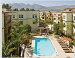
Cielo Los Angeles, CA 119 Units, Built 2009 $33,100,000