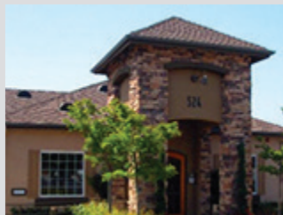
Park Central Upland, CA 128 Units, Built 2005 $26,450,000